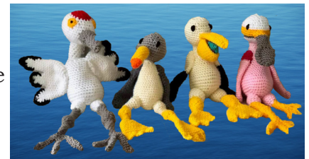
Coastal Birds crocheted for McAllen

That’s all I needed. I bought some yarn, looked up crochet on YouTube and the rest is history. I have been a crocheting maniac ever since. I’ve made Koozies for water bottles, soda cans and coffee cups. I made fingerless gloves for all the women in my family. I made baby blankets, shawls, caps, beanies and shrugs for my friends.