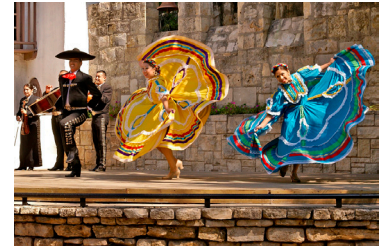
Dancers at Arneson River Theater

this unique gathering. All members are invited to attend, assist and participate in welcoming DKG members to our great state. Many volunteers are needed.