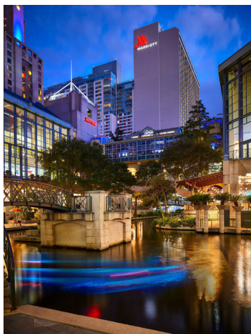
San Antonio Marriott Rivercenter

Information about the DKG International Conference in San Antonio is available on the DKG website, dkg.org . Schedules have been made, and Texans are volunteering to help make this conference a success. For members considering attending, hotel reservations are now open.