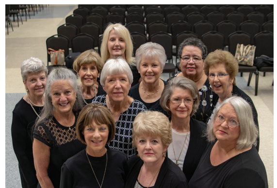
TSO Necrology Committee in Waco