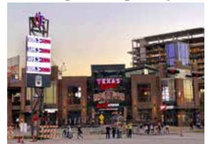
Texas Live! entertainment complex

Located just south of the Arlington Convention Center is Texas Live! , a new gathering spot. Members and their DKG friends can choose to eat at Guy Fieri's Taco Joint or the famous Lockhart Smokehouse. If athletes are more the style of the group, members can visit Pudge's Pizza or Troy's for great food and entertainment.