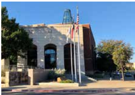
Arlington Convention Center

An exciting and inspirational aspect of every convention is the Unifying Project. Members at the 2019 TSO Convention are asked to donate items to CASA of Tarrant County and to the immediate surrounding counties that support Area 10. CASA, Court Appointed Special Advocates, is an organization that advocates for neglected and abused children and also provides a voice for them so they might have a brighter future.