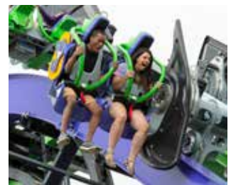
Six Flags Over Texas

For those members who want more activity or who are bringing children, Six Flags Over Texas and Hurricane Harbor are in the vicinity.