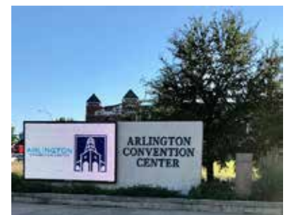
Arlington Convention Center

The Arlington Convention Center will host the business meetings, vendors and banquets. A very short walk out the back door of the convention center is the Sheraton Hotel. This will be the headquarters hotel and the site of the break-out sessions and art displays.