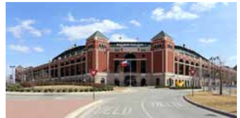
Globe Life Park

The Sheraton Hotel and Arlington Convention Center are located in the Entertainment District of Arlington. For sports fans, the Texas Rangers will be playing during the convention. Not only