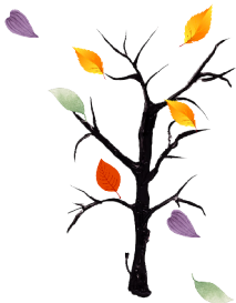
Tree of Gratitude

ASTE F is sponsoring a “Tree of Gratitude” Stewardship Giving Campaign November 1 through December 10, 2019. During this campaign, ASTEF members will be able to express gratitude for the influence others have had on their lives, both personally and professionally. Those making donations by December 10, 2019 will see the Tree of Gratitude grow and grow as beautiful leaves are added to adorn the special tree. Members may keep an eye on the ASTEF website as the progressive leafing of the Tree of Gratitude develops. A list of those being honored will also be available on the ASTEF website at the end of the campaign.