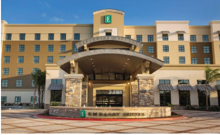
Embassy Suites 800 Convention Center Blvd. McAllen, Texas 78501 1-956-688-8329

The Embassy Suites by Hilton is open for members to reserve rooms for the McAllen Convention. A block of rooms has been reserved for June 14, 2020 - June 22, 2020. The special room rate of $134 will be available until May 22 or until the group block is sold out, whichever comes first.