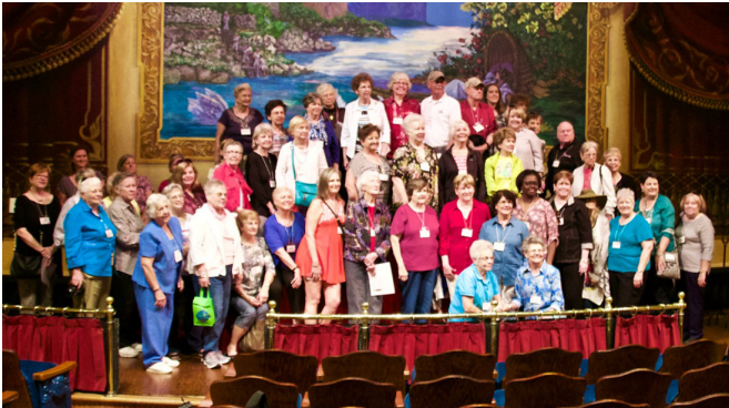
Weekenders on stage at The Grand 1894 Opera House

In October, fifty-four ASTEF members and guests enjoyed a fun-filled weekend in historic Galveston as a part of the ASTEF Travelers Program's first ASTEF Weekender. The event began on Friday evening with a welcome dinner and a visit from the famous pirate Jean Lafitte who wooed the gathering with his version of his infamous history. Unfortunately, he did not divulge the location of his famous hidden treasure.