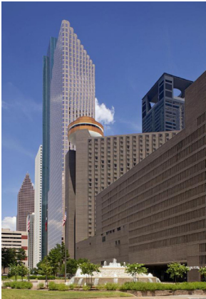
Hyatt Regency downtown Houston