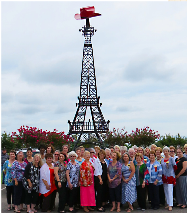
Area 17 attendees celebrating in front of Eiffel Tower in Paris.