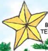
BOB BULLOCK TEXAS HISTORY MUSEUM