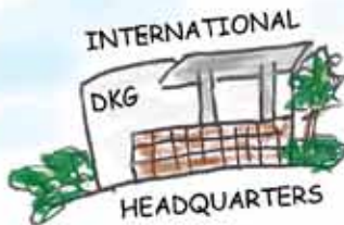
INTERNATIONAL DKG HEADQUARTERS