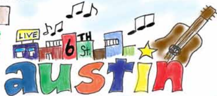
LIVE MUSIC ON 6TH ST. austin