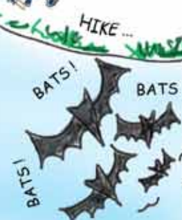
BATS! BATS! BATS!