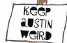
KEEP AUSTIN WEIRD