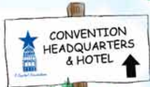
CONVENTION HEADQUARTERS & HOTEL