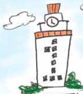
UNIVERSITY OF TEXAS