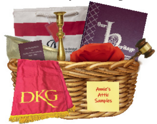
Many more items can be seen on dkgtexas.org/resources