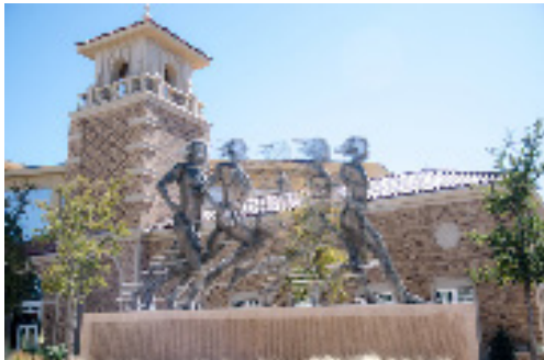
Run Simon Donovan & Ben Olmstead Sports Performance Center A female figure in five stages exhibits the development of a runner.

Texas Tech takes pride in being one of the top universities in the nation in public art. Visitors may walk about the Lubbock campus twenty-four hours a day and experience art created by world-renown artists. The campus is an outdoor museum.