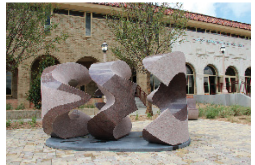
Mechanism Frank Swanson Maddox Engineering Research Center Carvings are a physical representation of the transmission and transforming of energy.