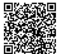
TSO Chapter Spotlight docs.google.com

Scholarships, Leadership, Projects, Grants https://www.astef.org/purposes.html