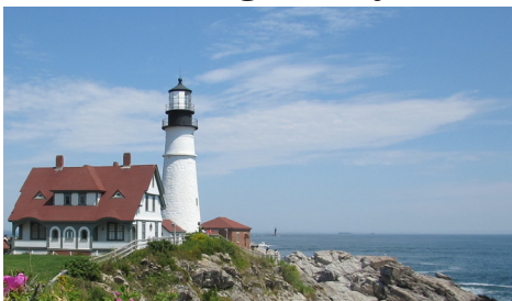
Portland Headlight & Museum is Maine's oldest lighthouse

Mother Nature puts on a spectacular show every October, when the eastern forests burst into red, orange, and yellow hues. That makes autumn the perfect season to explore New