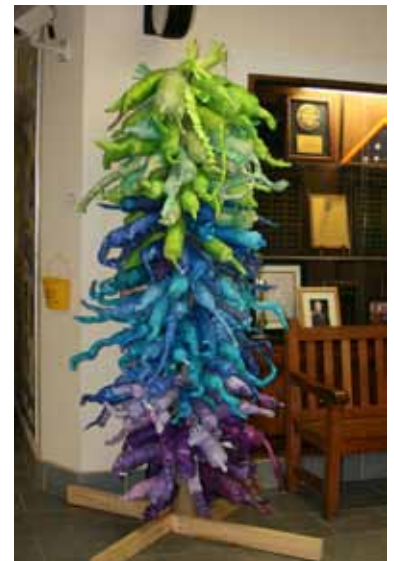
Tower Created by 4th grade artists

It was easy to inspire excitement when the children were able to see the works so beautifully displayed at the Arboretum. As an art teacher, being able to inspire children to create their own masterpieces is my ultimate goal!