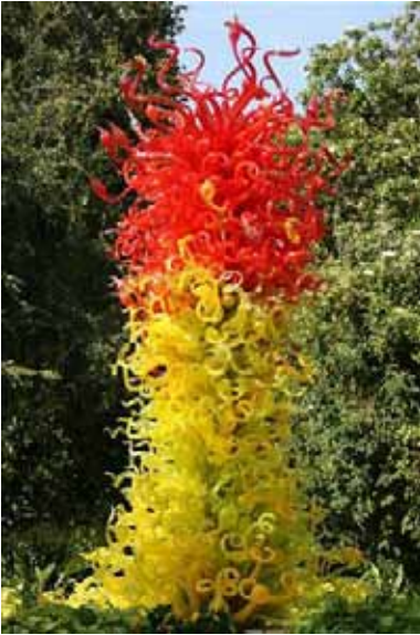
Chihuly Tower at the Dallas Arboretum

Were you one of the lucky ones who caught the Dallas Arboretum's Dale Chihuly glass sculpture exhibit in 2012? I was drawn to these sculptures many times both day and night during the show's tenure last year. The very first time I went was soon after I found out I got the job at Bradfield Elementary in Highland Park teaching art to k-fourth graders. Seven hundred young artists awaited me, and the planning book was completely empty for the 2012-2013 school year. After visiting the Arboretum I knew the first big exhibit I was going to plan for my new students...Chihuly creations!