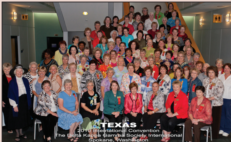
The Texas delegation to the International Convention in Spokane is pictured above.