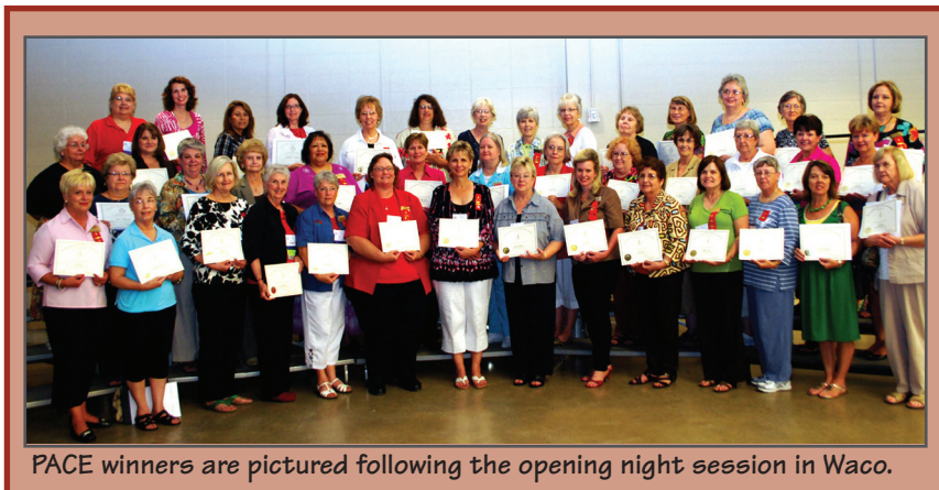
PACE winners are pictured following the opening night session in Waco.